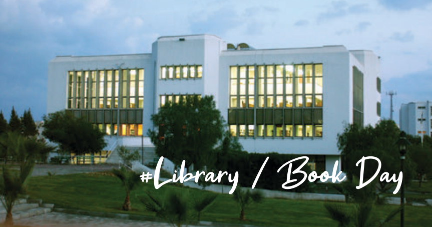
#Library / Book Day