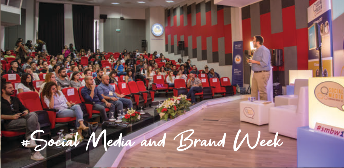
#Social Media and Brand Week